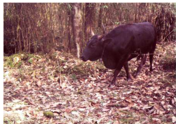
Figure 2 A free-ranging bull foraging in the deep jungle, far away (about 3 km) from human settlement

Of the total cattle encountered in the nearby forests, only 14.3% ( n = 150 ) were accompanied by herders (Figure 3), with the rest 85.7% ( n = 900 ) left to range freely. All 10 horses freely grazing in the forests were also not accompanied by herders. More than 80% ( n = 120 ) of those cattle accompanied by herders were situated closer to human settlements, mostly within 1.5-km distance from the settlement boundaries.