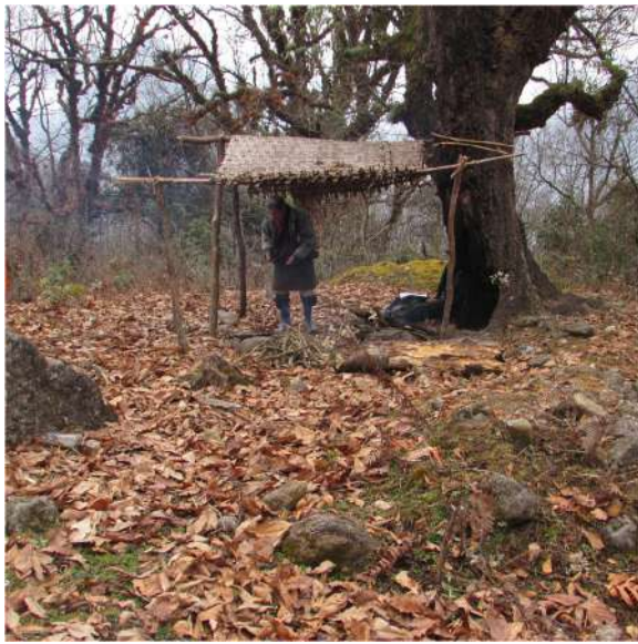
Figure 3 A cattle herder in Gasa Dzongkhag posing in front of his makeshift camp in a temperate broadleaved forest