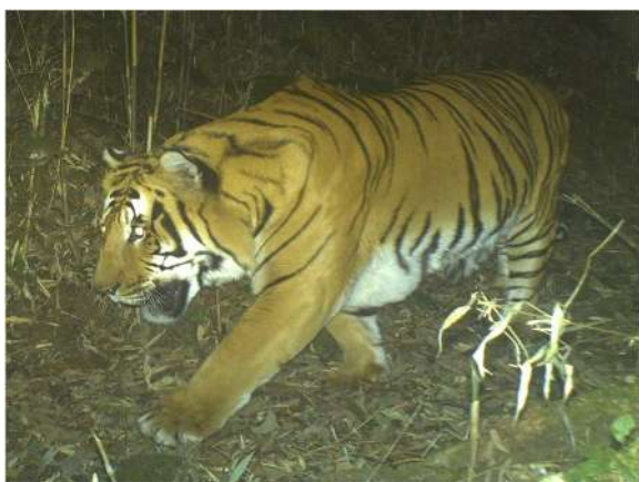
Figure 4 A male tiger caught on a camera trap at night after depredating a livestock in a forest surrounding Damji village of Khatoe Geog in Gasa Dzongkhag

Farmers lost 355 animals, mostly horses and cattle, during the period 2012 to 2014 to four main wild predators: 177 (49.9%) to dhole, 121 (34.1%) to common leopard, 38 (10.7%) to tiger (Figure 4), and 19 (5.3%) to Asiatic black bear Ursus thibetanus . There was significant difference in the number of livestock killed by each predator ( H_{(3)} = 74.68, p < 0.005 ), largely driven by dhole. The number of animals lost to different predators differed between the geogs. For example, Lingmukha Geog lost most of the livestock to leopards while Genye, Khatoe, Khamoe, and Shengabjimi lost most of their livestock to dholes (Table 1). Predation losses also differed among