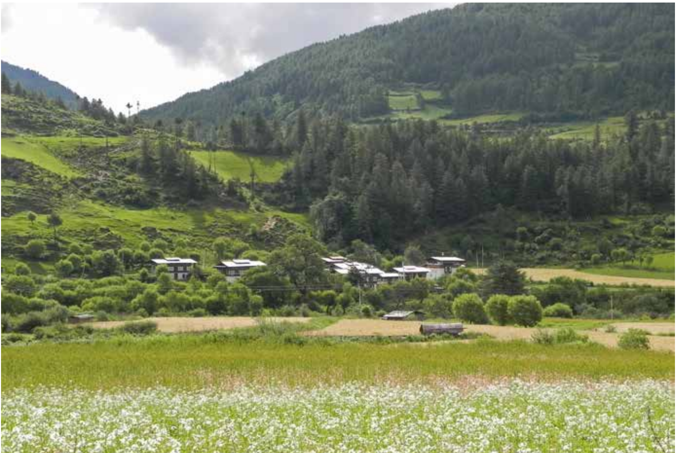
Agrarian landscape in the Tang Valley, Bumthang, Bhutan.

An ongoing concern for the government is to protect Bhutan's fragile mountain ecosystem, while providing a continuous supply of sustainably harvested forest resources to residents and businesses. Multiple policies relate to landscape management, including the National Forest Policy and the National Environment Strategy. These policies prioritize an integrated landscape approach to forest management, balancing forest conservation with sustainable use of forest resources. They recognize that landscape stewardship by upstream land and natural resource users is critical to downstream residents and water users. Thus, the government is calling upon residents of the upland landscapes in mountain regions, who are the farmers and herders, to shift their land use toward practices that favor forest cover restoration or conservation. These practices should have a distinct emphasis on water management, with respect to both overland flow and groundwater stores.