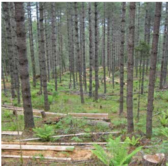
Harvest operation in a community forest near to UWICER center, Bhutan.